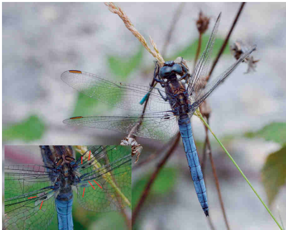
Fig 2. Seven biting midges Forcipomyia paludis on the wings of a male Orthetrum coerulescens while eating a male Ischnura elegans . Parc Natural de s'Albufera de Mallorca, Spain (18-vii-2014).